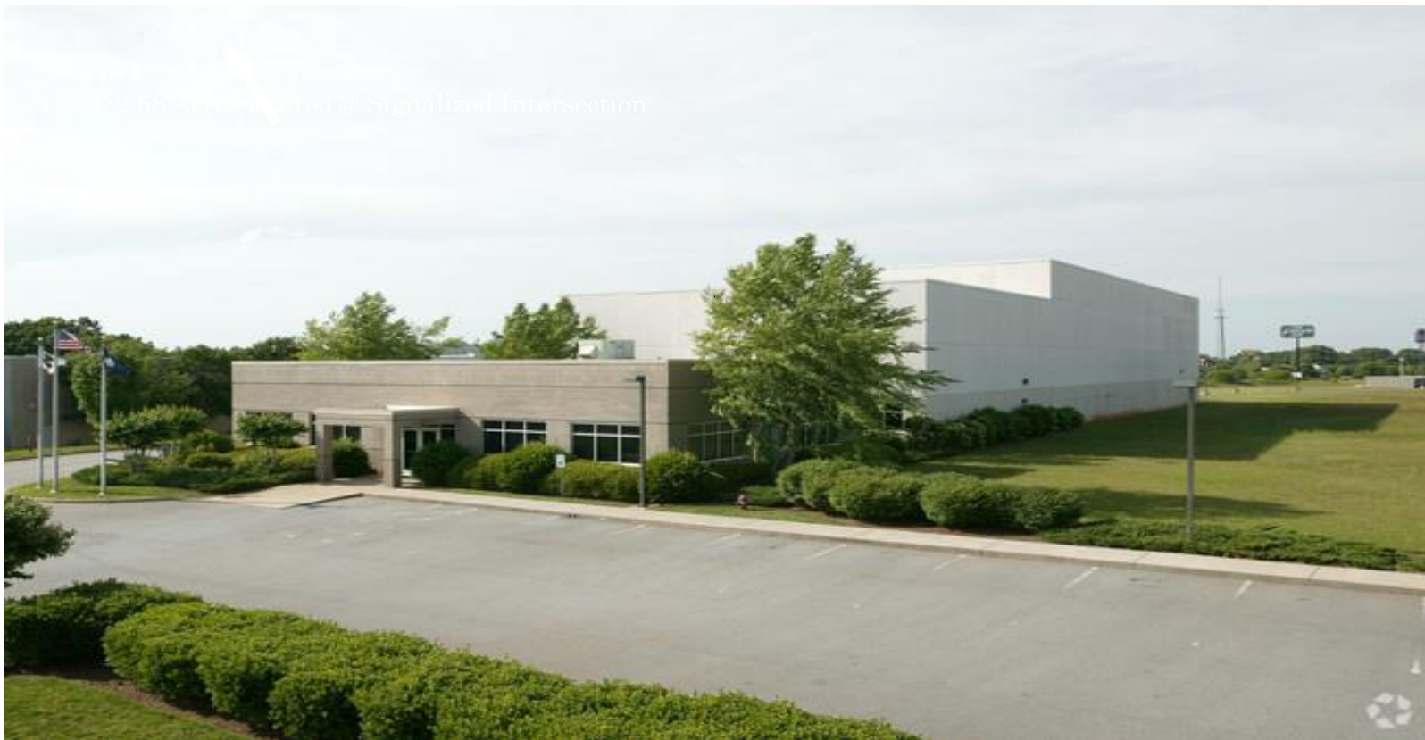
I-85 Access Point @ Signalized Intersection